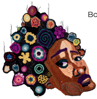
Bonita Johnston Blk Girl Maric

Attendees will learn the core skills for freestyle crochet beginning with basic knots on September 20 from 10 am to 1 pm, followed by learning how to make a menagerie of curves, shapes, and knots from 1 pm to 4pm. On September 27 from 9 am to 12 pm, attendees will use their skills to make 2-D designs including crochet scrumbles, crochet eyes, or projects of choice.